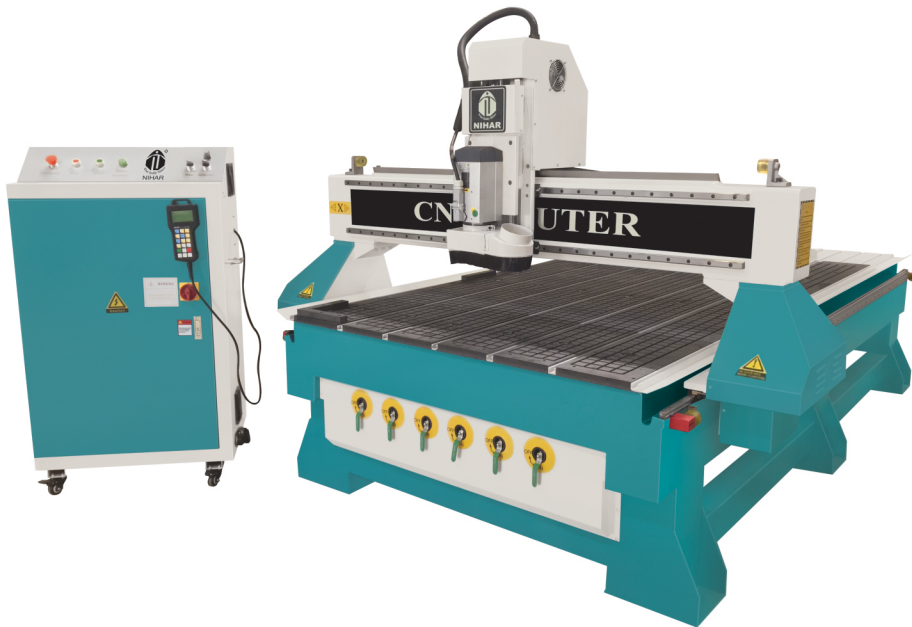
NR - 115