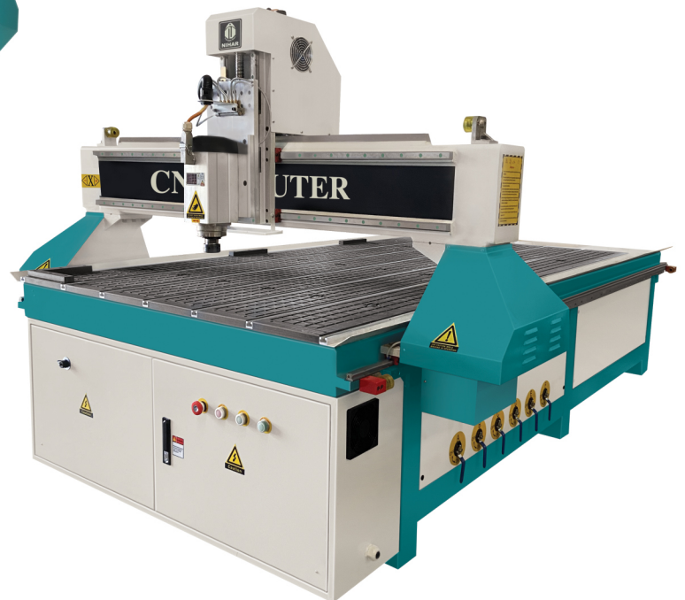
NR - 115 E